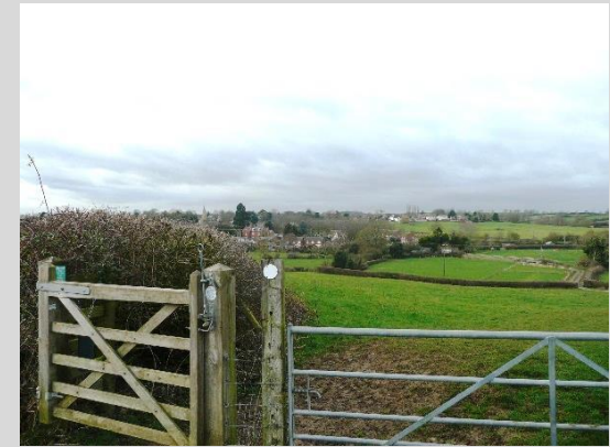
Northwest toward East Farndon

2 From a principal viewpoint on Harborough Road (gateway into inventory field 069), northeast across a permanent grazing field (Scheduled Monument - medieval village earthworks; ridge and furrow), and southeast downhill to the tree-bordered River Ise and onward to Brown's Hill and the eastern skyline.