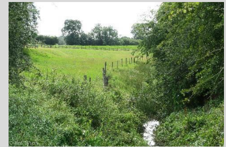
Southwest along the River Ise

4. From Naseby Road, northwest past the western edge of the village to the high ground to the north, and southwest over the Ise valley and open countryside toward the Naseby Hills on the southern horizon.