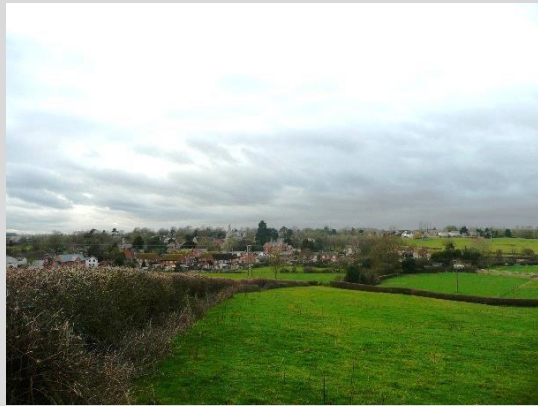
West toward the church

1. From several viewpoints on footpath CH15 and bridleway CH14 on the slope and summit of Brown's Hill, a broad panorama southwest to northwest into the Ise valley, over the village including the church and historic core to the high ground forming the parish boundary in the west.