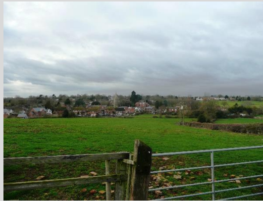
Into the village from lower down the hill